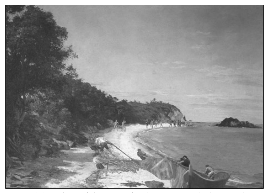
Fig. 4. While drying the sails of their boat, Carder's shipmates were attacked by a party of Portuguese and Tupi in the mouth of rio das Contas, near present-day Itacaré, Bahia. Digital rendering by the author.