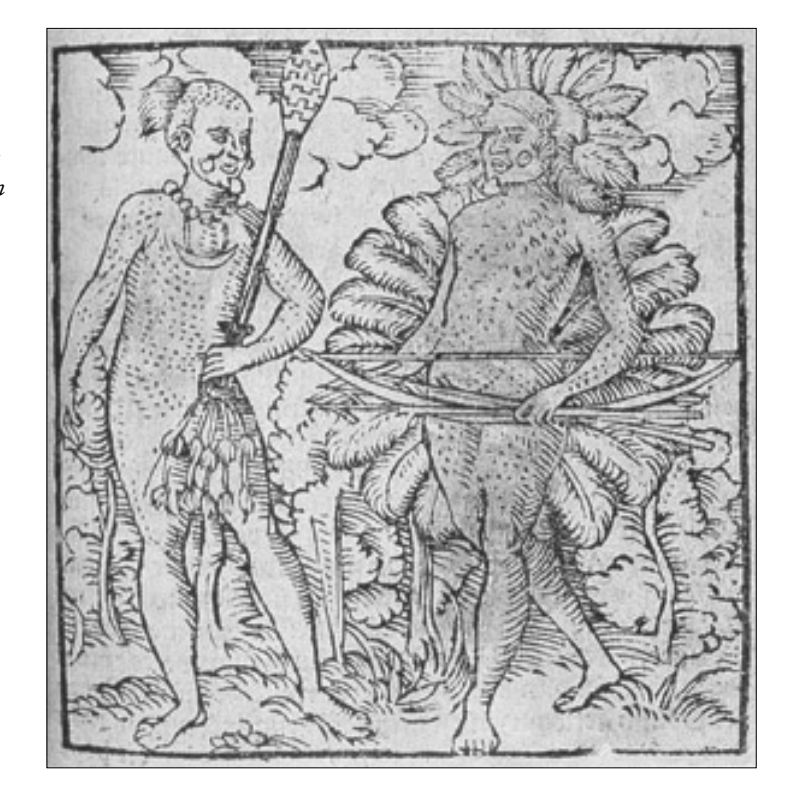
Fig. 2. Tupinambá indians. Wood carving from Hans Staden's Wahrhaftig' Historia vnd beschreibung eyner Landtschafft der Wilden Nacketen Grimmigen Menschfresser Leuthen in der Newen welt. America... (Marburg, 1557)

Alone, wielding a sword and a shield, he began walking along the coast toward Brazil. A short distance away he had a friendly encounter with a party of 30 bowmen and eight women, whom he calls Tupan Basse ( tupinambás ). Carder was taken to their village of four long houses laid out in a square, and inhabited by 4,000 people. (Fig. 2)