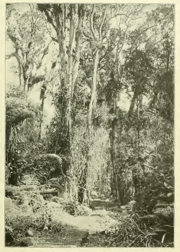
IN THE FORESTS OF PUNA (HENSHAW)